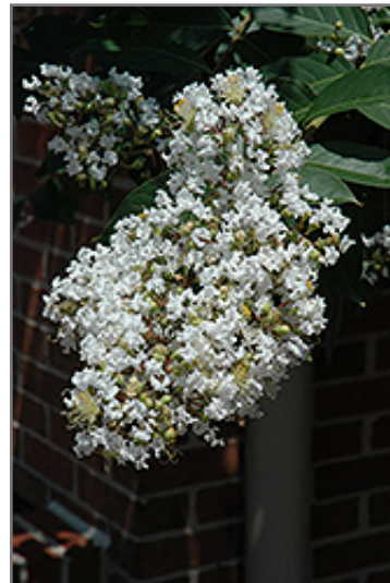
Natchez Crapemyrtle flowers

Natchez Crapemyrtle is recommended for the following landscape applications;