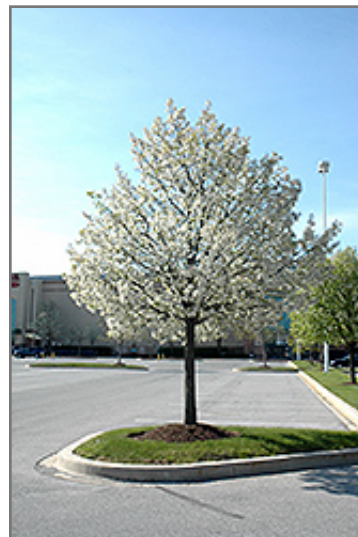
Jack Ornamental Pear in bloom