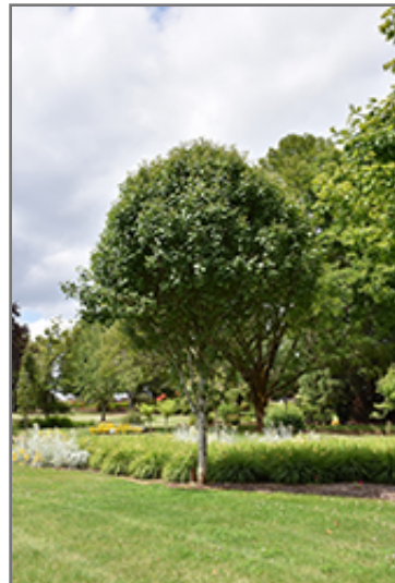
Jack Ornamental Pear

This tree should only be grown in full sunlight. It prefers to grow in average to moist conditions, and shouldn't be allowed to dry out. It is not particular as to soil type or pH. It is highly tolerant of urban pollution and will even thrive in inner city environments. This is a selected variety of a species not originally from North America.