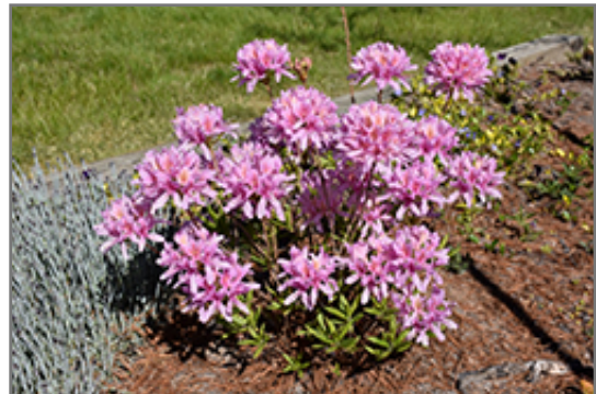
Orchid Lights Azalea in bloom