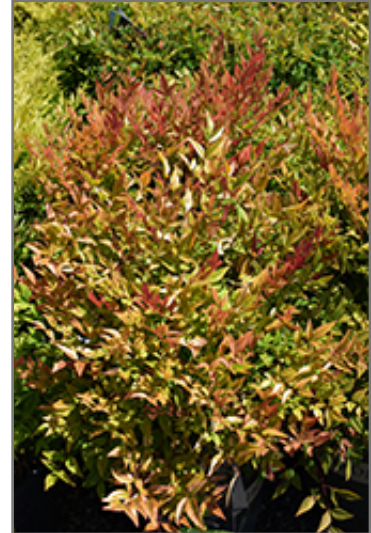
Gulf Stream Dwarf Nandina

Gulf Stream Dwarf Nandina makes a fine choice for the outdoor landscape, but it is also well-suited for use in outdoor pots and containers. Because of its height, it is often used as a 'thriller' in the 'spiller-thriller-filler' container combination; plant it near the center of the pot, surrounded by smaller plants and those that spill over the edges. It is even sizeable enough that it can be grown alone in a suitable container. Note that when grown in a container, it may not perform exactly as indicated on the tag - this is to be expected. Also note that when growing plants in outdoor containers and baskets, they may require more frequent waterings than they would in the yard or garden.