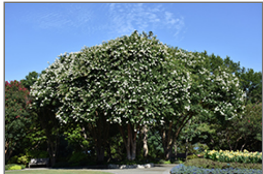
Natchez Crapemyrtle in bloom