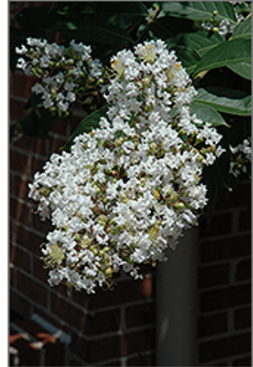
Natchez Crapemyrtle flowers

Natchez Crapemyrtle is recommended for the following landscape applications;