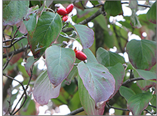
Cherokee Chief Flowering Dogwood fruit

This tree does best in full sun to partial shade. You may want to keep it away from hot, dry locations that receive direct afternoon sun or which get reflected sunlight, such as against the south side of a white wall. It requires an evenly moist well-drained soil for optimal growth, but will die in standing water. It is very fussy about its soil conditions and must have rich, acidic soils to ensure success, and is subject to chlorosis (yellowing) of the foliage in alkaline soils. It is quite intolerant of urban pollution, therefore inner city or urban streetside plantings are best avoided, and will benefit from being planted in a relatively sheltered location. Consider applying a thick mulch around the root zone in winter to protect it in exposed locations or colder microclimates. This is a selection of a native North American species.