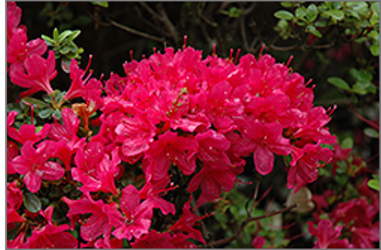
Hino Crimson Azalea flowers