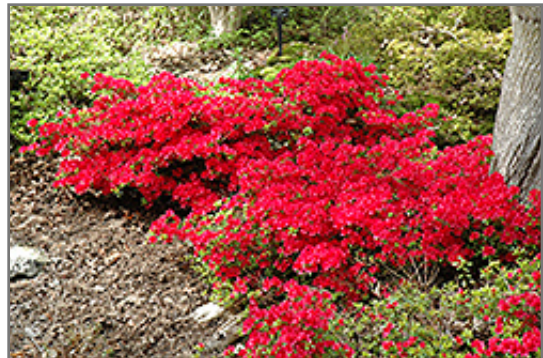
Hino Crimson Azalea in bloom