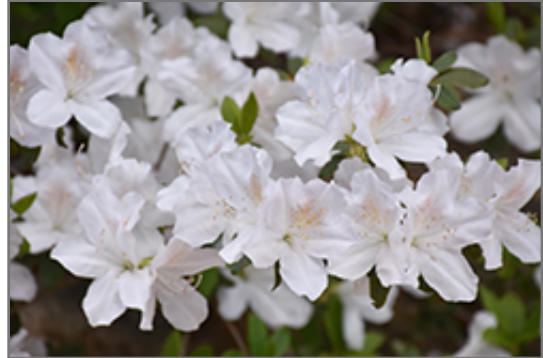
Delaware Valley White Azalea flowers