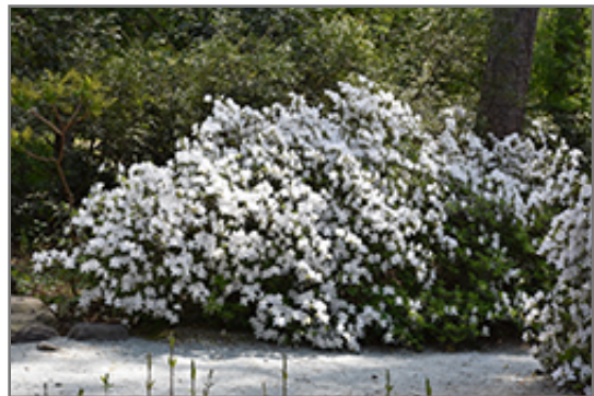
Delaware Valley White Azalea in bloom