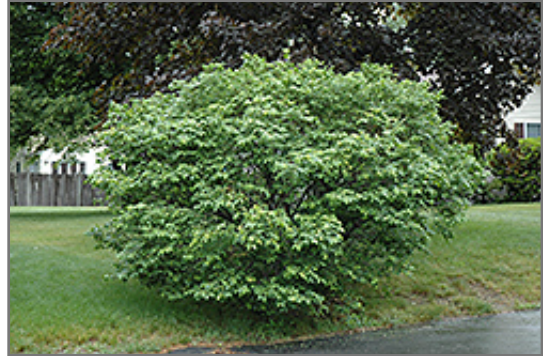
Compact Winged Burning Bush

Compact Winged Burning Bush will grow to be about 7 feet tall at maturity, with a spread of 7 feet. It tends to fill out right to the ground and therefore doesn't necessarily require facer plants in front, and is suitable for planting under power lines. It grows at a slow rate, and under ideal conditions can be expected to live for 50 years or more.