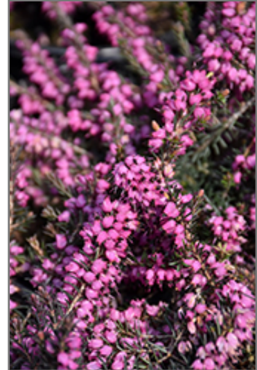
Springwood Pink Heath flowers