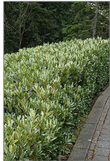
Otto Luyken Dwarf Cherry Laurel in bloom