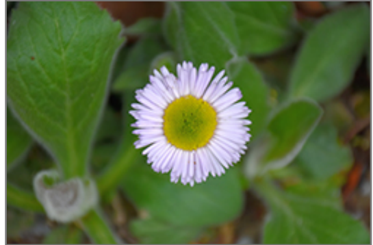
Lynnhaven Carpet Fleabane flowers

Lynnhaven Carpet Fleabane will grow to be about 7 inches tall at maturity extending to 15 inches tall with the flowers, with a spread of 15 inches. Its foliage tends to remain low and dense right to the ground. The flower stalks can be weak and so it may require staking in exposed sites or excessively rich soils. It grows at a fast rate, and under ideal conditions can be expected to live for approximately 10 years. As an herbaceous perennial, this plant will usually die back to the crown each winter, and will regrow from the base each spring. Be careful not to disturb the crown in late winter when it may not be readily seen!