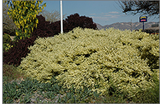
Moonlight Scotch Broom in bloom

Moonlight Scotch Broom is recommended for the following landscape applications;