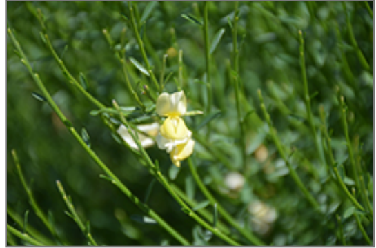
Moonlight Scotch Broom flowers

This shrub should only be grown in full sunlight. It prefers dry to average moisture levels with very well-drained soil, and will often die in standing water. It is considered to be drought-tolerant, and thus makes an ideal choice for xeriscaping or the moisture-conserving landscape. It is particular about its soil conditions, with a strong preference for clay, alkaline soils, and is able to handle environmental salt. It is highly tolerant of urban pollution and will even thrive in inner city environments. This is a selected variety of a species not originally from North America.