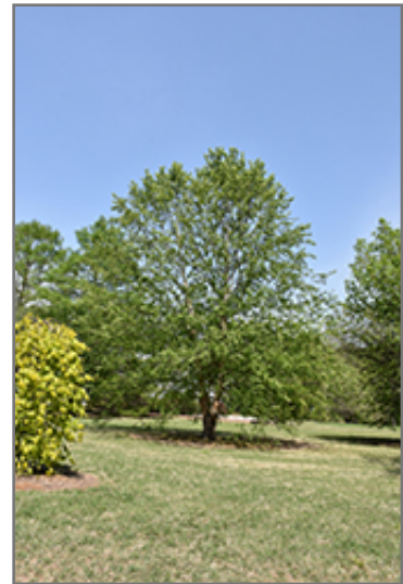
Dura Heat River Birch