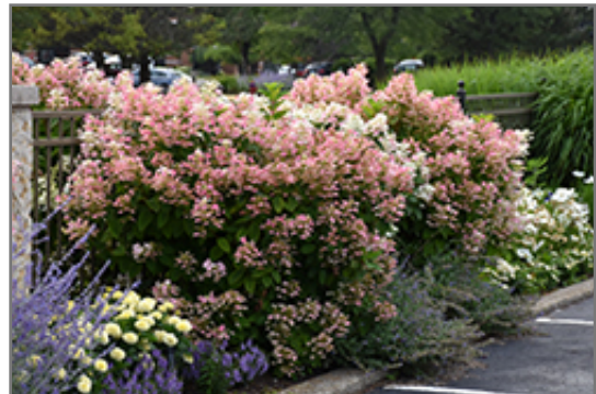
Quick Fire Hydrangea in bloom