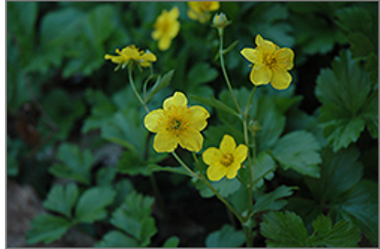
Barren Strawberry flowers