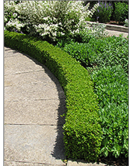
Green Velvet Boxwood

Green Velvet Boxwood makes a fine choice for the outdoor landscape, but it is also well-suited for use in outdoor pots and containers. Because of its height, it is often used as a 'thriller' in the 'spiller-thriller-filler' container combination; plant it near the center of the pot, surrounded by smaller plants and those that spill over the edges. It is even sizeable enough that it can be grown alone in a suitable container. Note that when grown in a container, it may not perform exactly as indicated on the tag - this is to be expected. Also note that when growing plants in outdoor containers and baskets, they may require more frequent waterings than they would in the yard or garden.