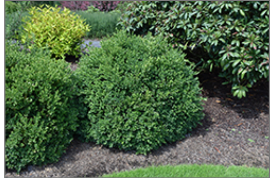
Green Velvet Boxwood