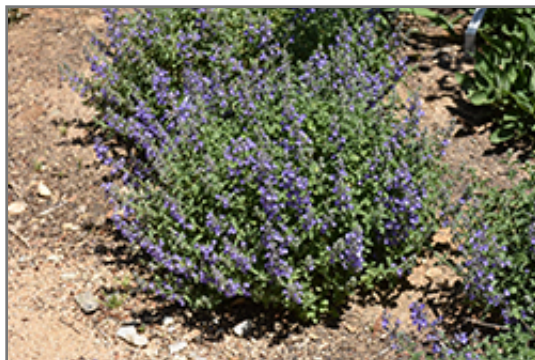
Sylvester Blue Catmint in bloom