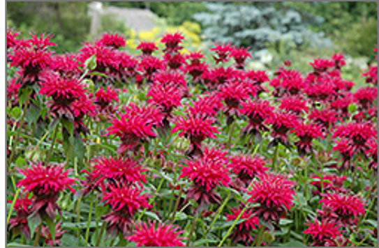
Raspberry Wine Beebalm flowers

Raspberry Wine Beebalm is recommended for the following landscape applications;