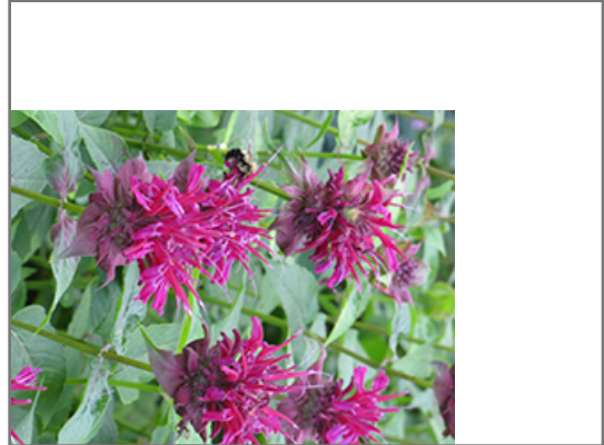
Raspberry Wine Beebalm flowers

Raspberry Wine Beebalm will grow to be about 30 inches tall at maturity, with a spread of 32 inches. When grown in masses or used as a bedding plant, individual plants should be spaced approximately 28 inches apart. It grows at a fast rate, and under ideal conditions can be expected to live for approximately 5 years. As an herbaceous perennial, this plant will usually die back to the crown each winter, and will regrow from the base each spring. Be careful not to disturb the crown in late winter when it may not be readily seen!