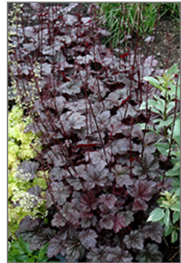
Plum Pudding Coral Bells in bloom