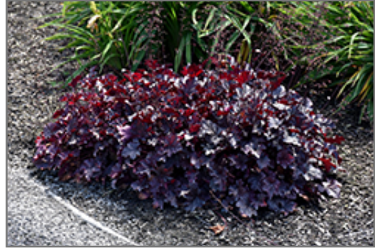
Plum Pudding Coral Bells

Plum Pudding Coral Bells will grow to be only 6 inches tall at maturity extending to 12 inches tall with the flowers, with a spread of 12 inches. When grown in masses or used as a bedding plant, individual plants should be spaced approximately 10 inches apart. Its foliage tends to remain low and dense right to the ground. It grows at a medium rate, and under ideal conditions can be expected to live for approximately 10 years. As an evergreen perennial, this plant will typically keep its form and foliage year-round.