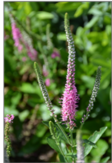
Perfectly Picasso Speedwell flowers