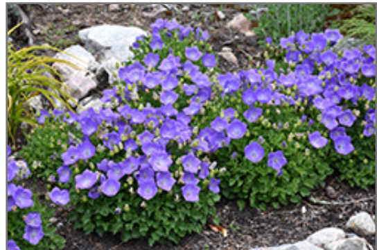
Rapido Blue Bellflower in bloom