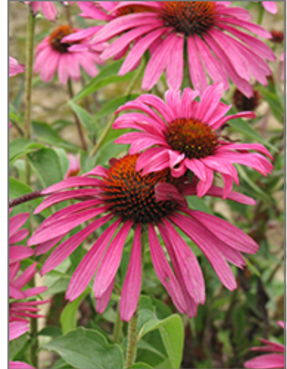
Ruby Star Coneflower flowers