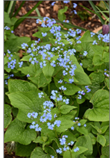
Siberian Bugloss flowers