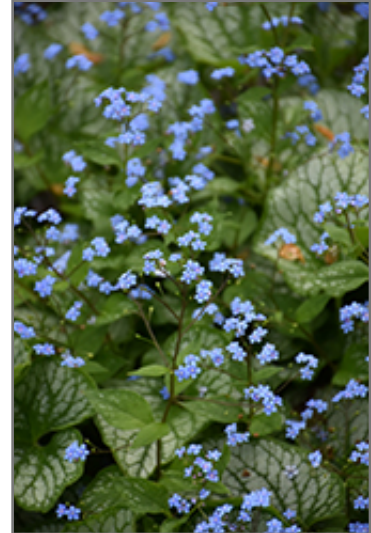
Sea Heart Bugloss flowers

Sea Heart Bugloss is recommended for the following landscape applications;