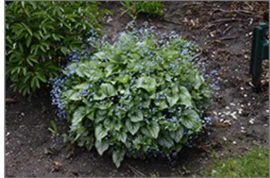
Sea Heart Bugloss in bloom

Sea Heart Bugloss will grow to be about 12 inches tall at maturity extending to 16 inches tall with the flowers, with a spread of 18 inches. When grown in masses or used as a bedding plant, individual plants should be spaced approximately 14 inches apart. It grows at a medium rate, and under ideal conditions can be expected to live for approximately 10 years. As an herbaceous perennial, this plant will usually die back to the crown each winter, and will regrow from the base each spring. Be careful not to disturb the crown in late winter when it may not be readily seen!