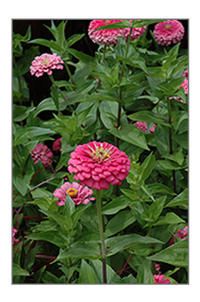
Miss Willmott Zinnia flowers

Miss Willmott Zinnia will grow to be about 32 inches tall at maturity, with a spread of 24 inches. When grown in masses or used as a bedding plant, individual plants should be spaced approximately 18 inches apart. Its foliage tends to remain dense right to the ground, not requiring facer plants in front. This fast-growing annual will normally live for one full growing season, needing replacement the following year.