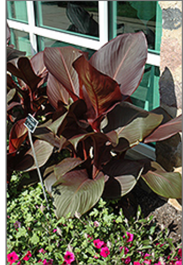
Tropicanna Black Canna

This plant should only be grown in full sunlight. It prefers to grow in moist to wet soil, and will even tolerate some standing water. It is not particular as to soil type or pH. It is highly tolerant of urban pollution and will even thrive in inner city environments. Consider applying a thick mulch around the root zone in winter to protect it in exposed locations or colder microclimates. This particular variety is an interspecific hybrid. It can be propagated by division; however, as a cultivated variety, be aware that it may be subject to certain restrictions or prohibitions on propagation.