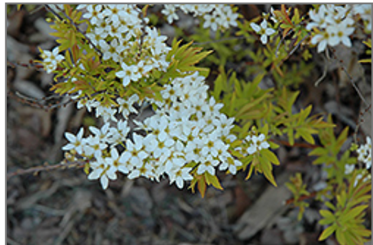
Mellow Yellow Spirea flowers