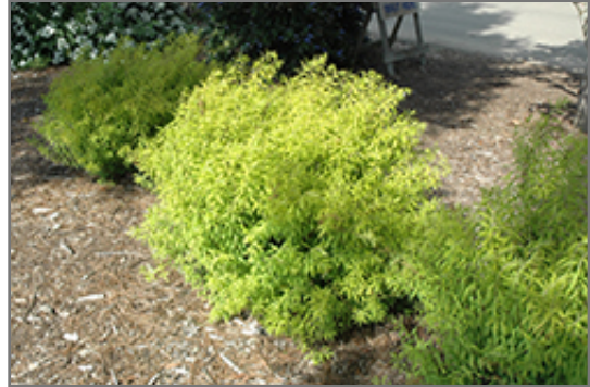
Mellow Yellow Spirea

Mellow Yellow Spirea is recommended for the following landscape applications;