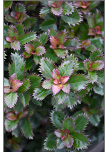
Sallywag Holly foliage