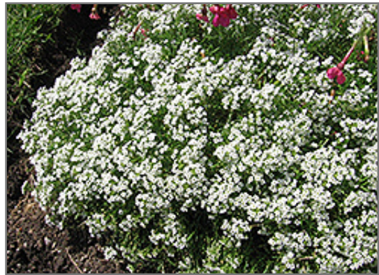
Wonderland White Alyssum in bloom