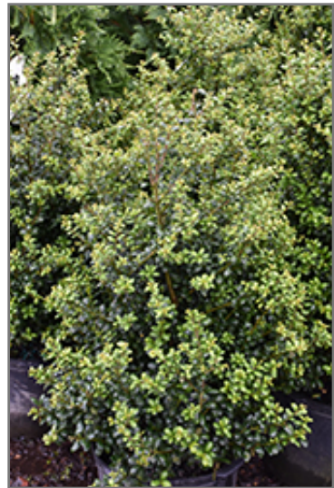
Chesapeake Japanese Holly