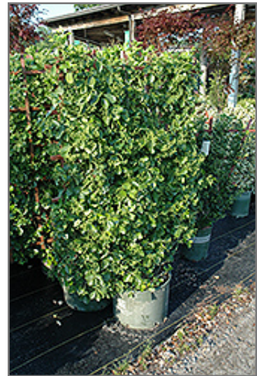
Manhattan Spreading Euonymus