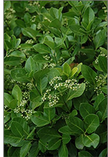
Manhattan Spreading Euonymus flowers

This shrub performs well in both full sun and full shade. It is very adaptable to both dry and moist locations, and should do just fine under average home landscape conditions. It is not particular as to soil type or pH. It is highly tolerant of urban pollution and will even thrive in inner city environments, and will benefit from being planted in a relatively sheltered location. This is a selected variety of a species not originally from North America.