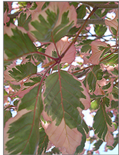
Tricolor Beech foliage