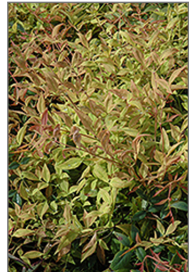
Gulf Stream Dwarf Nandina foliage