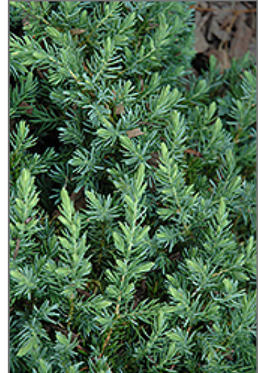
Blue Pacific Shore Juniper foliage