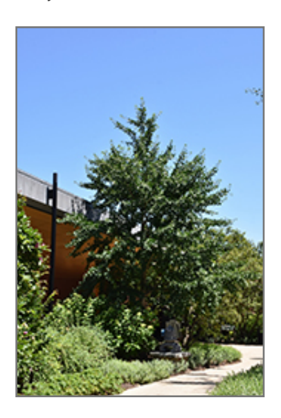
Autumn Gold Ginkgo