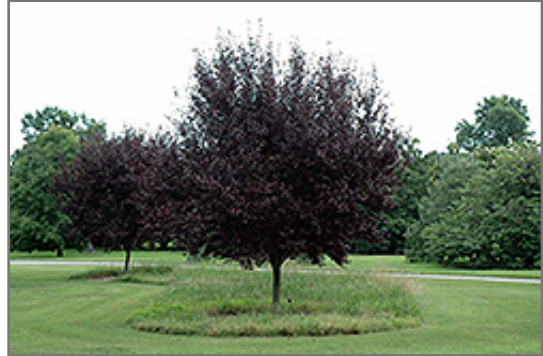
Krauter Vesuvius Plum

This tree should only be grown in full sunlight. It does best in average to evenly moist conditions, but will not tolerate standing water. It is not particular as to soil type or pH. It is highly tolerant of urban pollution and will even thrive in inner city environments. This is a selected variety of a species not originally from North America.