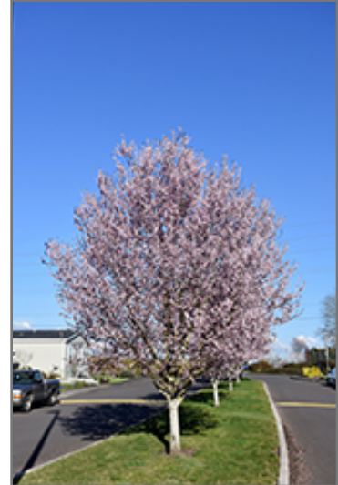
Krauter Vesuvius Plum in bloom