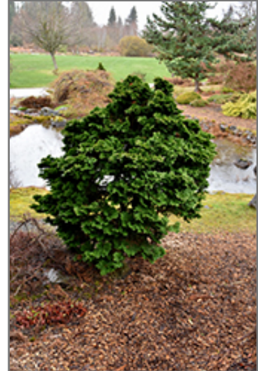
Dwarf Hinoki Falsecypress

Dwarf Hinoki Falsecypress will grow to be about 4 feet tall at maturity, with a spread of 4 feet. It tends to fill out right to the ground and therefore doesn't necessarily require facer plants in front. It grows at a medium rate, and under ideal conditions can be expected to live for 40 years or more.