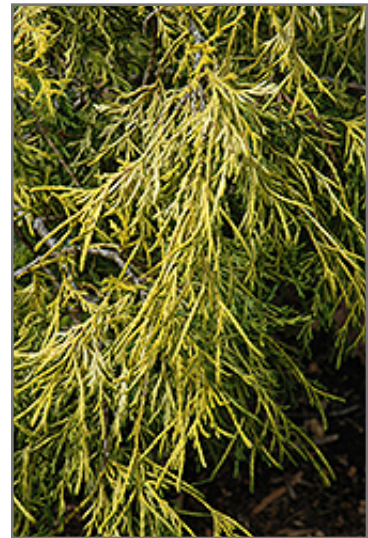
Lemon Thread Falsecypress foliage