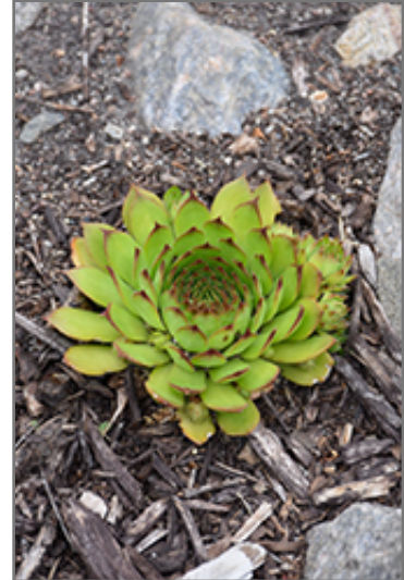
Sunset Hens And Chicks