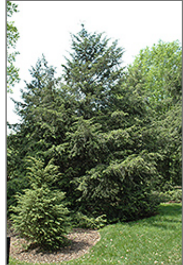
Canadian Hemlock