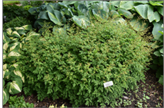
Misty Lace Goatsbeard

Misty Lace Goatsbeard will grow to be about 24 inches tall at maturity, with a spread of 24 inches. Its foliage tends to remain dense right to the ground, not requiring facer plants in front. It grows at a medium rate, and under ideal conditions can be expected to live for approximately 12 years. As an herbaceous perennial, this plant will usually die back to the crown each winter, and will regrow from the base each spring. Be careful not to disturb the crown in late winter when it may not be readily seen!