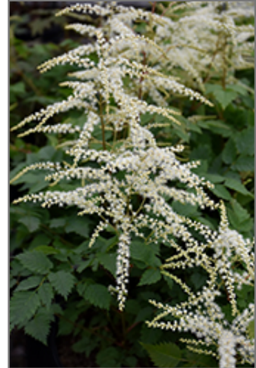
Misty Lace Goatsbeard flowers

Misty Lace Goatsbeard is recommended for the following landscape applications;