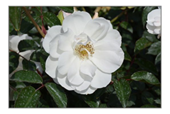
Iceberg Rose flowers

Iceberg Rose is recommended for the following landscape applications;