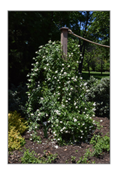
Iceberg Rose in bloom