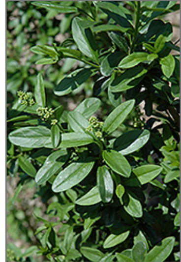
California Privet foliage

California Privet will grow to be about 10 feet tall at maturity, with a spread of 10 feet. It has a low canopy with a typical clearance of 1 foot from the ground, and is suitable for planting under power lines. It grows at a fast rate, and under ideal conditions can be expected to live for approximately 30 years.