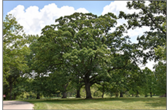
White Oak

White Oak is recommended for the following landscape applications;