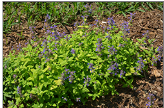
Chartreuse On The Loose Catmint in bloom