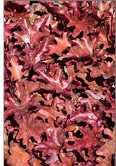
Peach Flambe Coral Bells foliage

This is a relatively low maintenance plant, and should be cut back in late fall in preparation for winter. It is a good choice for attracting hummingbirds to your yard. It has no significant negative characteristics.