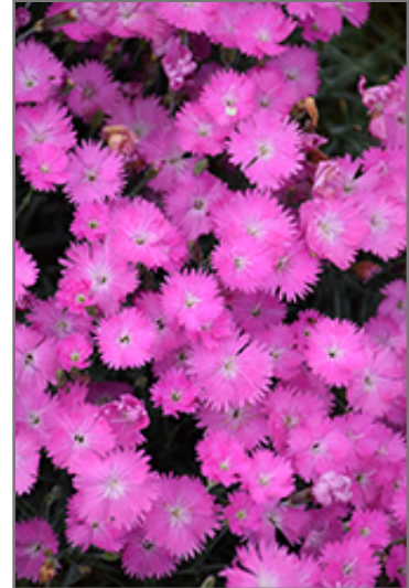
Firewitch Pinks flowers

Firewitch Pinks is recommended for the following landscape applications;