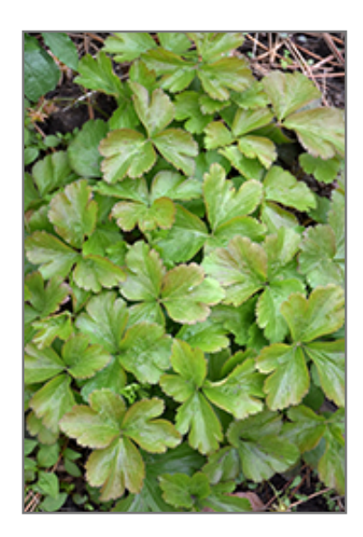
Barren Strawberry