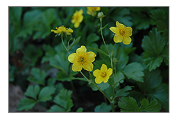
Barren Strawberry flowers