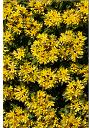
Rock 'N Round Bright Idea Stonecrop flowers

Rock 'N Round Bright Idea Stonecrop is recommended for the following landscape applications;